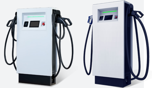
EVA 5430G / EVA 5460G